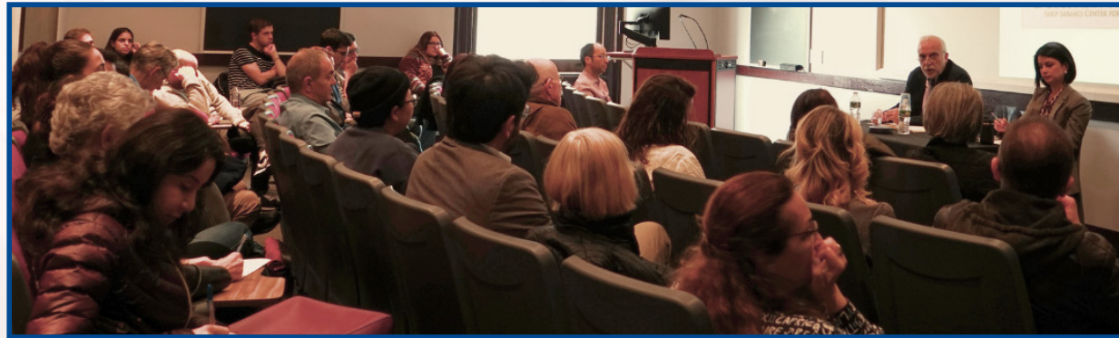
ELECTIONS, EARTHQUAKES, AND THE QUEST FOR A NEW DIRECTION

The academic year 2022-2023 for Columbia Global Centers | Istanbul has been marked by the devastating twin earthquakes that epicentered in Southeastern Turkey, causing damage both in Turkey and Syria. Destroying an area as big as entire countries and resulting with the death of tens of thousands, the earthquake was a tragic incident that impacted our way of thinking this year, urging us to prioritize resilience and equitable recovery.