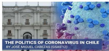
The Politics of Coronavirus in Chile | By: José Miguel Cabezas