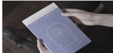
Diosas de lo Íntimo | By: Ximena Vial